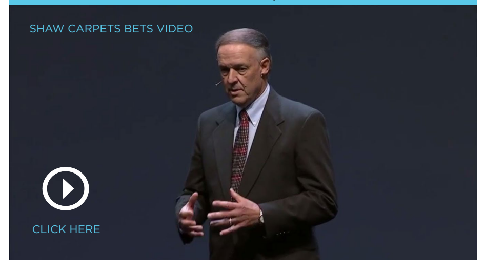
The CIO of Shaw carpets discusses the motivation to choose NetSuite to support their international manufacturing expansion into China.